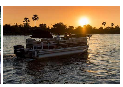
Day 3-6 Machaba Camp, Khwai Community Area