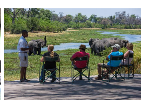
Day 6-9 Shinde Footsteps, Okavango Delta