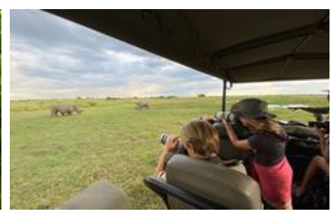
Day 9 End of Itinerary